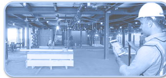
360° VR Photography Services