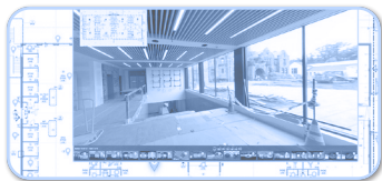
Photography Documentation Software