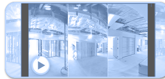
Short-term Time-Lapse Video