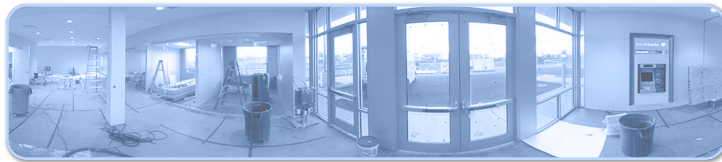
360° Spherical Photos and Videos

Specification includes camera system and managed services